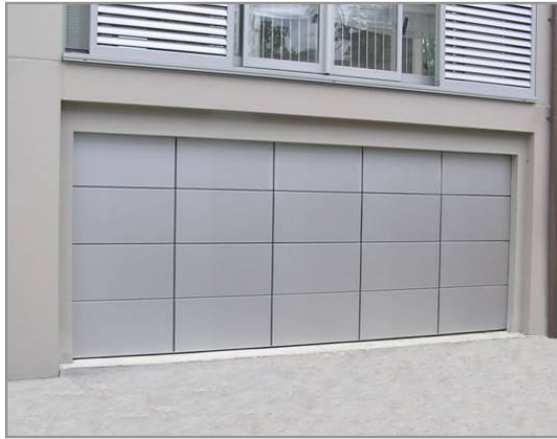
Ashton Ali Composite Sectional Door