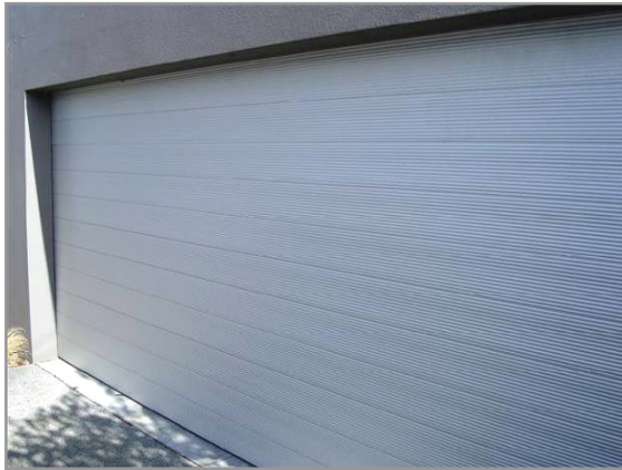
Ashton Ripple 150 Sectional Door