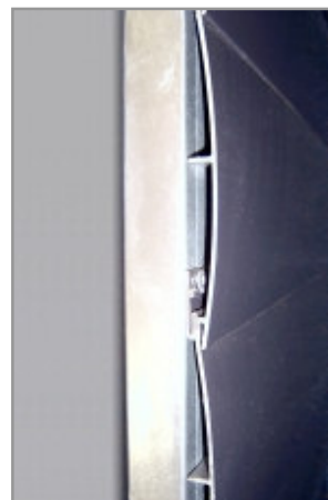
Typical construction method.

Nu-Wall® cladding can be powder-coated in a vast array of colours to suit any colour scheme. Anodising is also available on request.